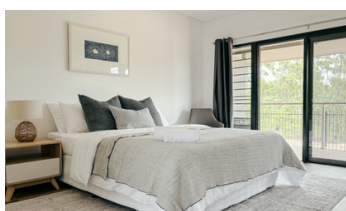
Yanawal Units | $270 p/n 14 Self Contained Units