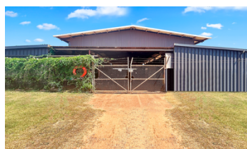
6A Traeger Circuit | $570K 2 bed | Commercial Rental