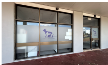
Shop 2 Arnhem House 95.6m 2 | Commercial Space