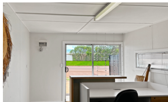
6B Traeger Close | $700 p/w 3 Offices | Industrial Site