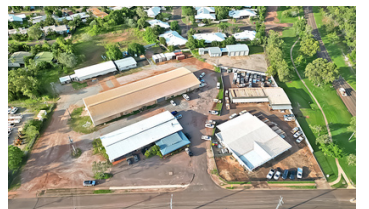
6 Arnhem Road | $950k Mixed-Use Commercial Complex