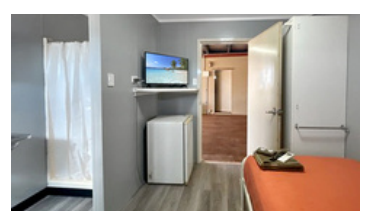
Wallaby Beach $175 p/n 15 Single Room Camp