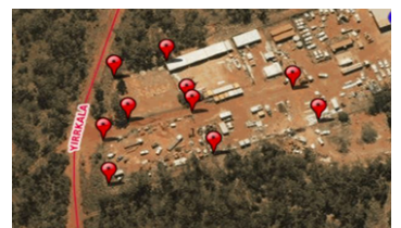
85 Galpu Road | $600-850 p/w 2 x 1000-2000m2 for lease